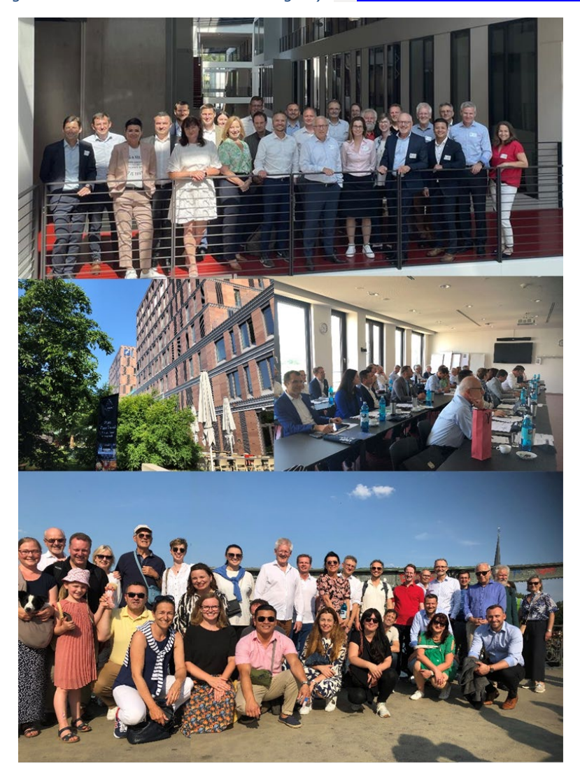
The next general assembly will take place in Prague on June 8th. Our special thanks goes to Olga Cechlová and Ladislav Profota for hosting.

Below a few impressions of our meeting. Some pictures and shared presentations you can find here (due to intern regulations limited access until 6th August): IGC Presentations and Pictures